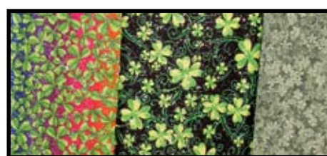
St. Patrick's Day 2012