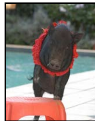
Belly, South Africa 2006

$25 includes 1st Class Shipping in the U.S.