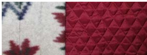
NavahoSilver w/maroon lining

Heart (just behind front legs) _____ Length: (ears to base of tail) _____