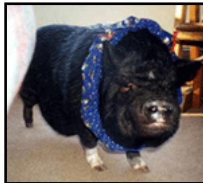
Harry Swinedell, Clay, NY 1997

The perfect accessory for your beautiful porcine pal. Each has a different colorful top-side, complete with ribbons and bells, making your party pig perfectly stylish at their next outing. These are the festive materials to choose from: