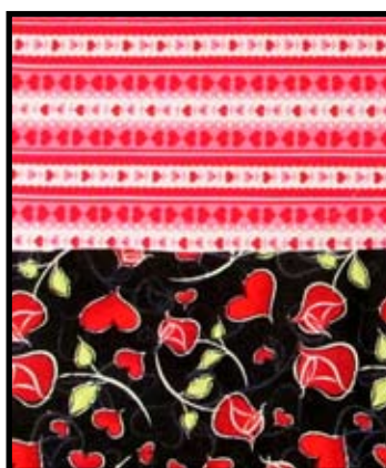
ValenSwine's Day 2012