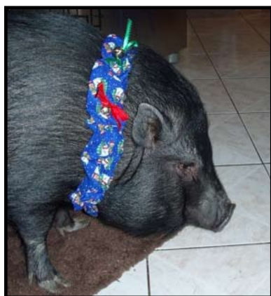
Georgie, Calgary, Canada 2010

Pig Scrunchies are easy to put on and comfortable for your pig with 1" non-roll elastic that will give as they move but should be removed while sleeping. The bells can be easily removed for machine washing in cold water, then tumble dried on low, then re-attached. Made to last a lifetime. They are not intended for restraint.