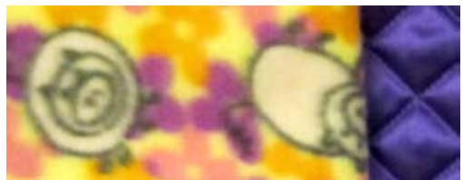
Pigw/purple lining WildWave w/maroon lining.