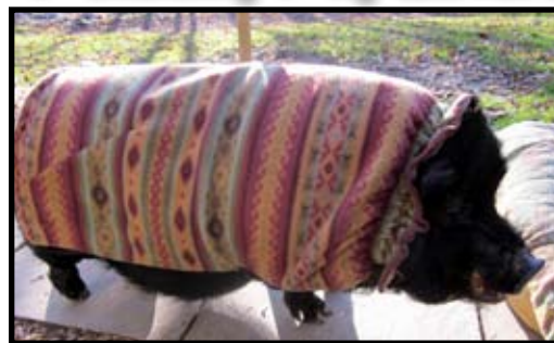
Pigletto from Wallkill, NY 2010

We began providing high-quality Custom Winter Pig Capes more than 15 years ago and they have made their way to potbelly pigs all over the world. Each one has been tailored specifically to each pig's measurements and there are photos on our website in The Potbelly Pig Place where you can check them out. When I was no longer able to handle the work load myself, my mom—Gruntma to 5 grand-pigs at the time—took over most of the pig-cape production. Unfortunately she isn't up to it anymore at 82, so in order to help fill the need this year, last season we made up the base for 6 pig capes in the most common sizes we've seen over the years which can still be customized to your pig's neck and heart-girth measurements.